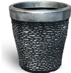
Mourne Stone Planter Available Colours Silver