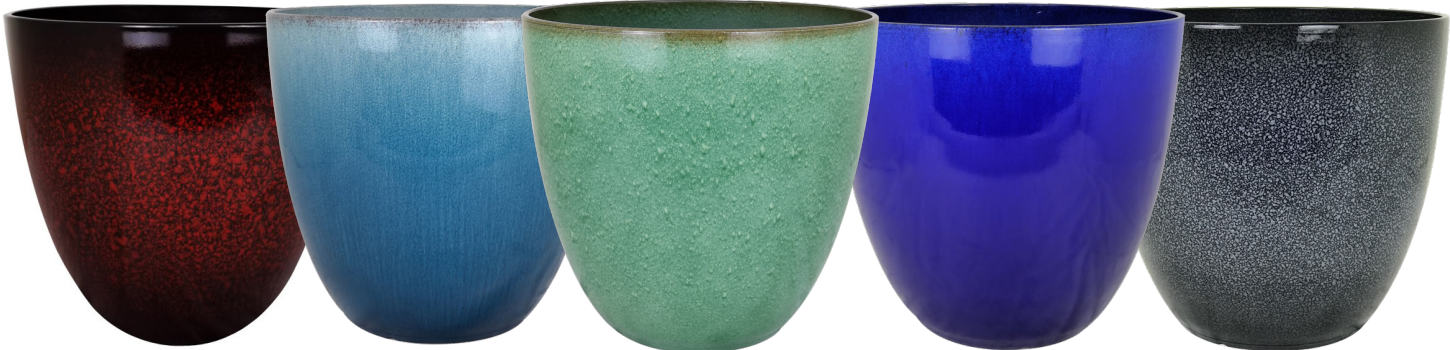
Cherry Red Ocean Blue Irish Jade Royal Blue Volcanic Ash

We have a number of decorative planters available in various shapes and sizes. A selection are shown here. Please contact us for more information.