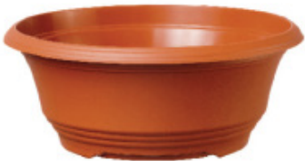
Teku Terracotta Bowls Available Sizes: 17cm, 23cm, 27cm, 30cm, 35cm Case Quantity: 50