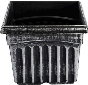
Plumbridge Silver Square Available Sizes: 26cm Available Colours Silver