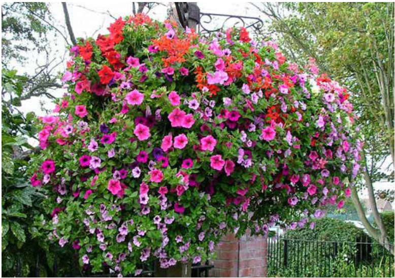
Available in a variety of colours

Cleverley designed in partnership with Nurseries, In Bloom groups and Horticulturists with ease of use, durability and low maintenance in mind our self-watering Pagoda Hanging Baskets are available in either an 18” or 20” design. The Pagoda Hanging Baskets share the same popular design features as the rest of the Pagoda range, such as an internal water reservoir and self-watering capillary wicking allowing for days without watering, and an extremely effective compost to water ratio. Both Pagoda Baskets have a number of features which make them environmentally friendly and encourage plant,growth/health to create a fantastic, high impact display, season after season.