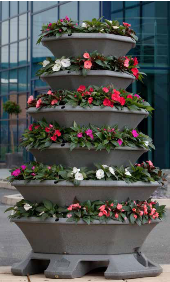
Base Footprint: 1090 x 1090 mm Available in a variety of colours

Cleverley designed in partnership with Nurseries, In Bloom groups and Horticulturists with ease of use, durability and low maintenance in mind our self-watering Pagoda Hanging Baskets are available in either an 18” or 20” design. The Pagoda Hanging Baskets share the same popular design features as the rest of the Pagoda range, such as an internal water reservoir and self-watering capillary wicking allowing for days without watering, and an extremely effective compost to water ratio. Both Pagoda Baskets have a number of features which make them environmentally friendly and encourage plant,growth/health to create a fantastic, high impact display, season after season.