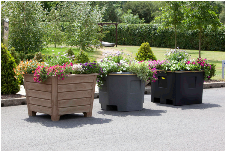
Available in Oak, Teak & Black effects