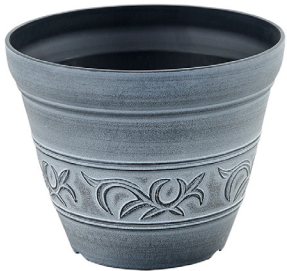
Portavogie Planter Available Sizes: 25cm Available Colours Grey