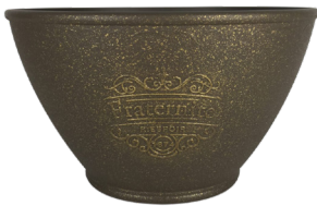
Liberty Bowl Available Sizes: 24cm Available Colours Gold Silver