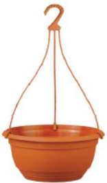
Teku MAL Hanging Basket Available Sizes: 20cm, 25cm, 27cm, 30cm Case Quantity: 50