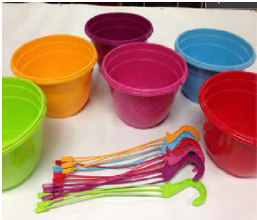
Teku Coloured Hanging Baskets Available Sizes: 27cm