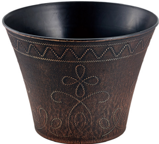
Saintfield Planter Available Sizes: 25cm Available Colours Silver Copper