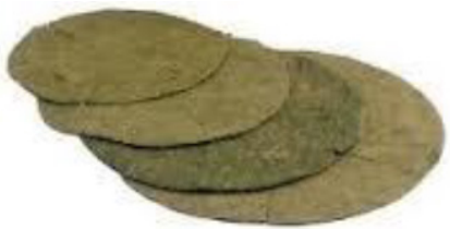
Wire Basket Liners Available Sizes: 12", 14", 16" Case Quantity: 50 or 100

We have a number of baskets & bowls available in various shapes and sizes. A selection are shown here. Please contact us for more information.