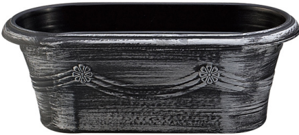
Cookstown Trough Available Sizes: 40cm Available Colours Silver Copper