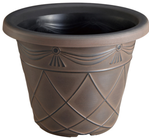
Ballywalter Planter Available Sizes: 25cm, 30cm Available Colours Silver Brown Grey

The California Collection Available Sizes: 38 x 31cm Great alternative to glazed pots, these very strong compression moulded pots are available in 5 colours.