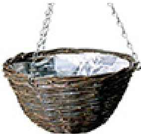
Wicker Hanging Basket Case Quantity: 24