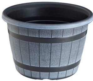
JFM Barrel Available Sizes: 25cm Available Colours Grey