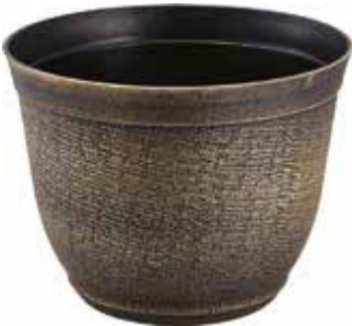
Newmills Planter Available Sizes: 25cm Available Colours Gold Silver