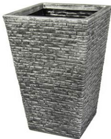
Donegal Slate Topiary Square Available Colours Pewter