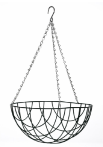
Wire Hanging Basket Available Sizes: 12", 14", 16" Case Quantity: 24