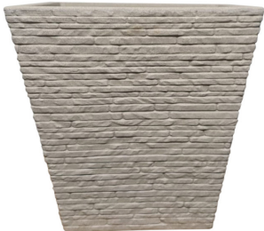
Donegal Slate Mini Square Available Colours Pewter Sandstone